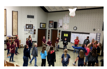
Breakout Session: Team Building and Effective Communication