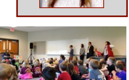
Breakout Session: How to be a Bucket Filler!